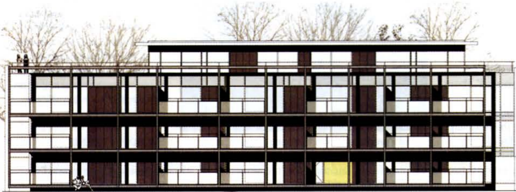
Above: typical elevation of the new housing. Right: 17 new blocks are added to the site. Below: Oaklands College before the canopy and pool were removed